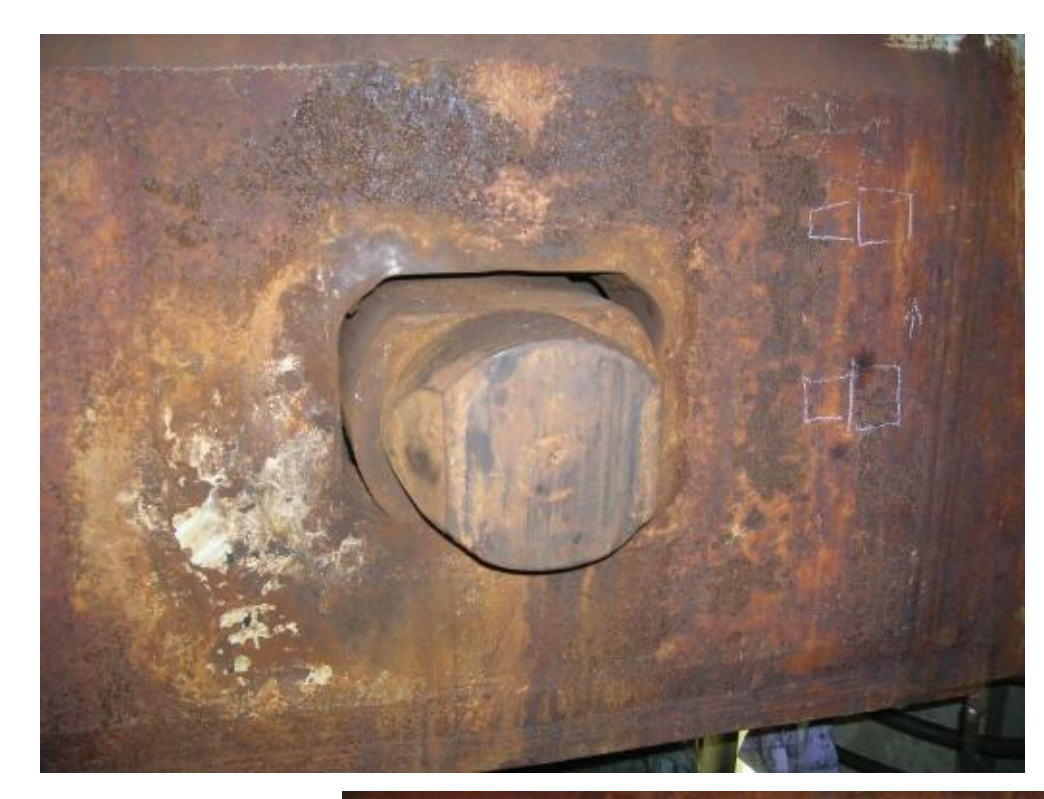
Worn pin and location

M & A replicated the centreline of the Jack-Up leg by setting one of our modular line boring bars to zero-zero readings off the leg location bore. Each horizontal bar centreline was set to bisect the vertical centreline.